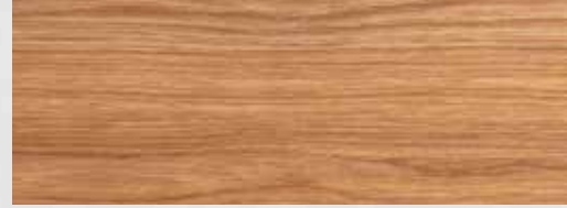
AT 504 Clic AT 504 DB