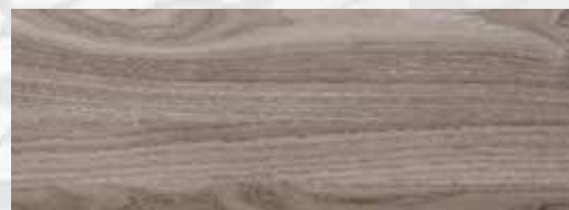
AT 507 Clic AT 507 DB