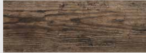
AT 512 Clic AT 512 DB