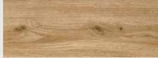
AT 505 Clic AT 505 DB