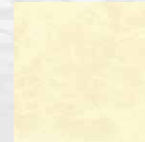
AT 607 Clic AT 607 DB