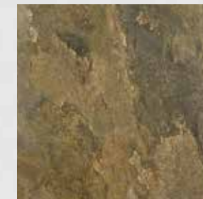
AT 603 Clic AT 603 DB