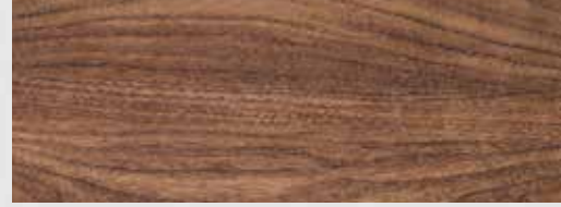
AT 511 Clic AT 511 DB