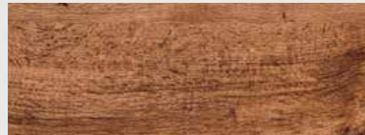
AT 510 Clic AT 510 DB