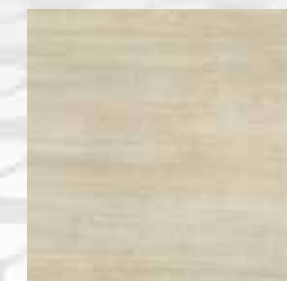
AT 610 Clic AT 610 DB