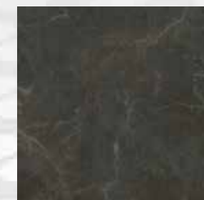
AT 605 Clic AT 605 DB