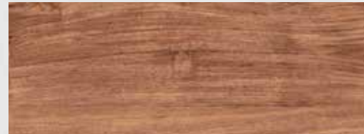
AT 508 Clic AT 508 DB