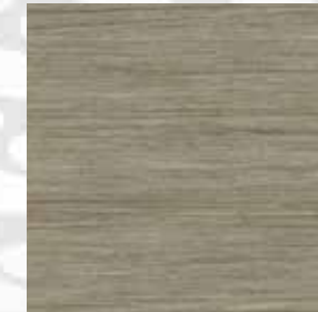
AT 601 Clic AT 601 DB