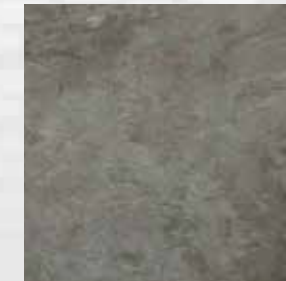
AT 602 Clic AT 602 DB