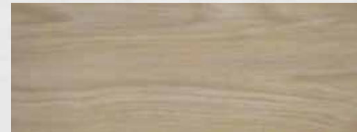
AT 516 Clic AT 516 DB