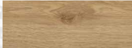
AT 501 Clic AT 501 DB