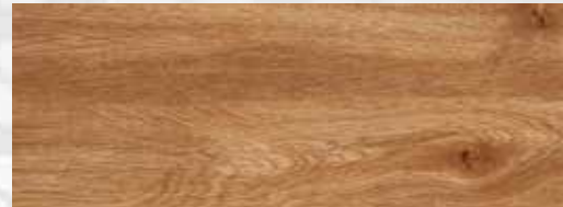
AT 500 Clic AT 500 DB