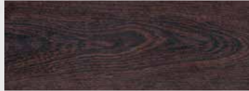
AT 513 Clic AT 513 DB