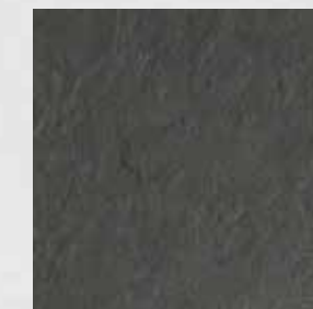
AT 604 Clic AT 604 DB