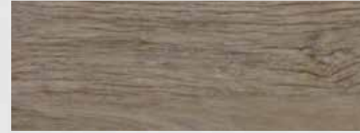
AT 517 Clic AT 517 DB