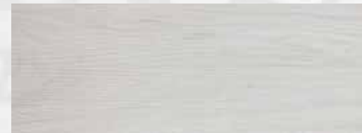
AT 514 Clic AT 514 DB