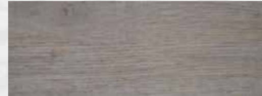
AT 515 Clic AT 515 DB