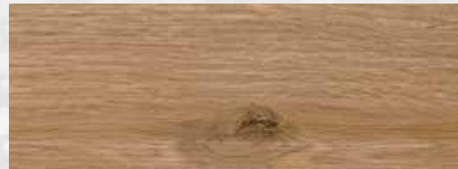
AT 506 Clic AT 506 DB