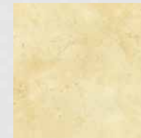
AT 608 Clic AT 608 DB