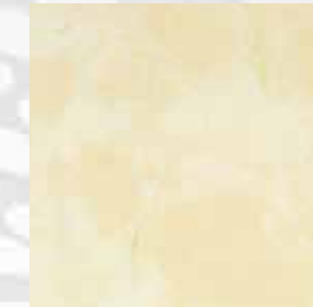
AT 606 Clic AT 606 DB