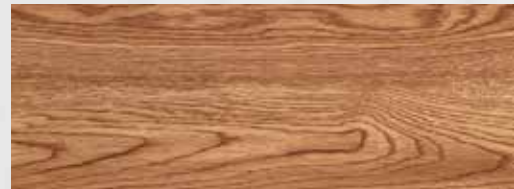
AT 509 Clic AT 509 DB