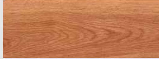
AT 503 Clic AT 503 DB