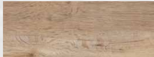
AT 502 Clic AT 502 DB