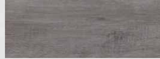
AT 518 Clic AT 518 DB