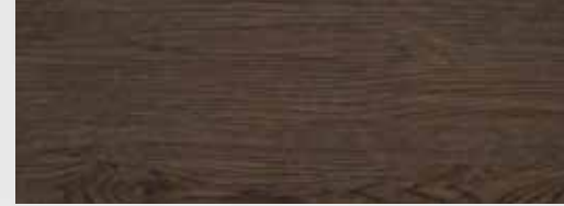
AT 519 Clic AT 519 DB